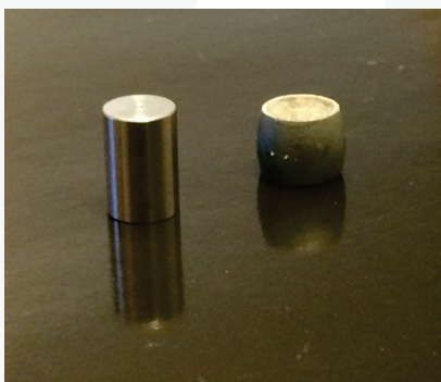
Typical sample before and after GLUS ® -analysis.

The GLUS ® is very suitable for in-situ analysis of microstructure and mechanical properties in metals during thermo-mechanical testing. GLUS ® gives a opportunity for reduction of cost during material development and is also a good tool for a larger understanding of the production process – what state is the metal in at position "X" in the process?